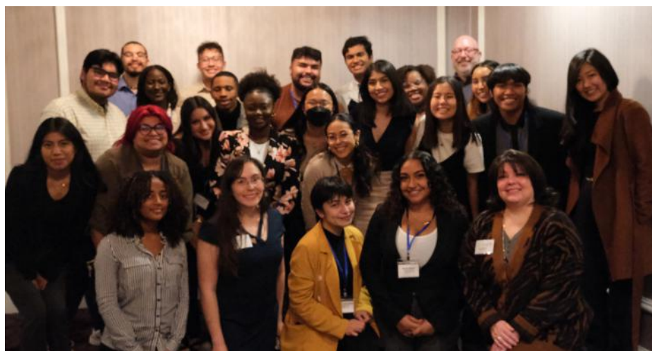
[Above: Our 2018 and 2019 Scholars pose for a group photo with volunteer professionals who engaged in career preparedness as part of Texas Leader Week]

Welcome to our last edition of 2022! This edition features a look back at all the accomplishments our HamFam shared with us ; plus, read more about Texas Leader Week , the new folks joining AHS in January , and so much more!